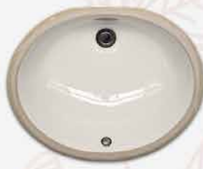
ITEM: A1916 WHITE (INSIDE 17 INCH X 14 INCH) (10+) PRICE: $16.00