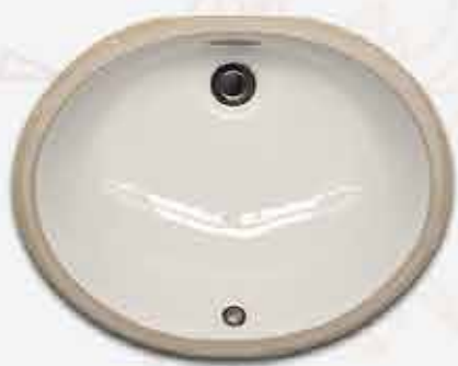
ITEM: A1913 WHITE (INSIDE 14.5 INCH X 11.5 INCH) (10+) PRICE: $12.00