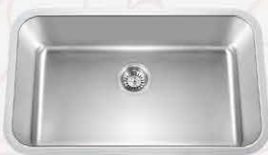
ITEM: U301 - 30 INCH (1+) PRICE: $60.00 (10+) PRICE: $55.00