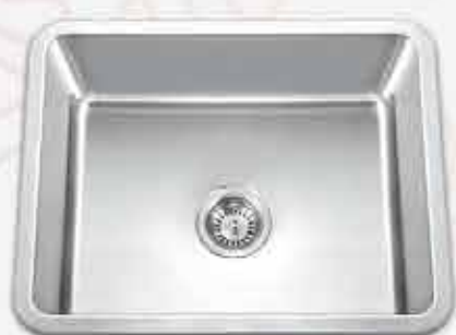
ITEM: U231-25 - 23 INCH (1+) PRICE: $60.00