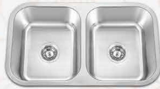
ITEM: U311 - 31 INCH (1+) PRICE: $60.00 (10+) PRICE: $55.00