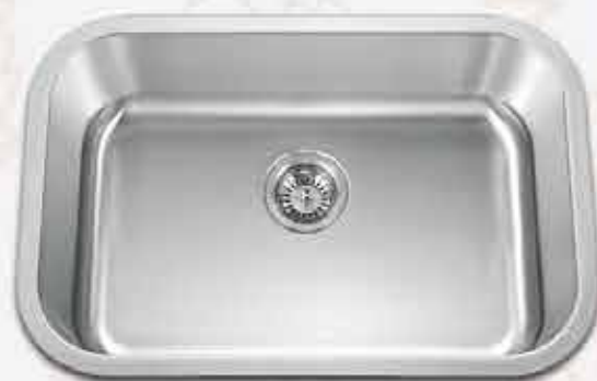
ITEM: U271 - 27 INCH (1+) PRICE: $65.00 (10+) PRICE: $57.00