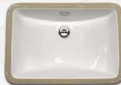
ITEM: AS2114 WHITE (INSIDE 18.75 INCH X 12.25 INCH) (10+) PRICE: $28.00