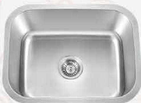
ITEM: U231 - 23 INCH (1+) PRICE: $42.00 (10+) PRICE: $35.00