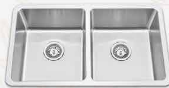
ITEM: U311-25 - 31 INCH (1+) PRICE: $70.00