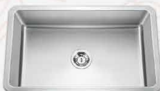
ITEM: U301-25 - 30 INCH (1+) PRICE: $70.00